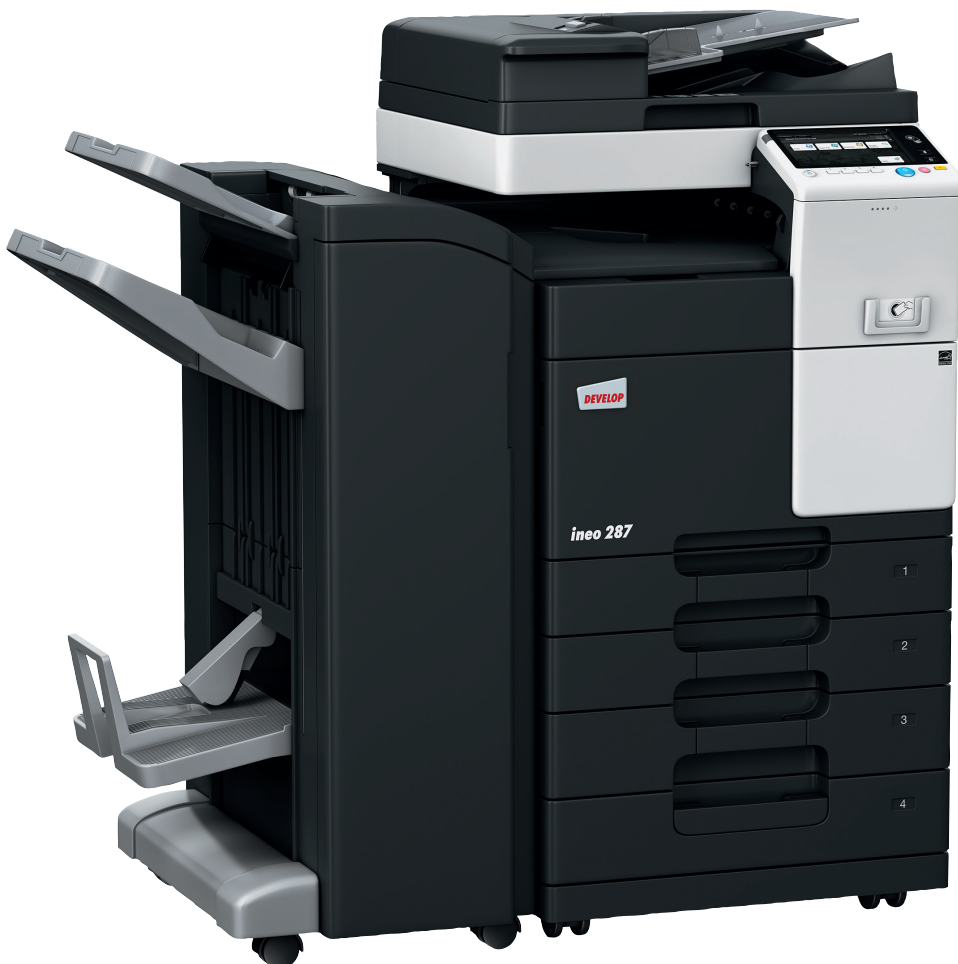
ineo 287 with document feeder (DF-628), staple/booklet finisher (FS-534SD), paper feeder (PC-213) and mount kit for local ID card authentication device (MK-735)

The monochrome devices features a variety of energy-saving functions that cut power consumption. Besides saving you money, these green features are also good for the environment – and your carbon footprint.